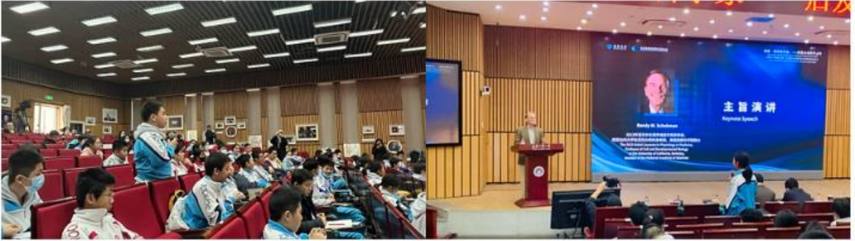
Prof. Schekman and students engaged in in-depth communication

The forum also featured insightful keynote speeches focusing on “Building Trust and Connections Through Communication” and “Preparing for Success in University and Careers”, coupled with a roundtable on “Empowering Youth for a Green Future”. These sessions saw experts and students engage in fervent discussions about sustainable global development, exchanging unique perspectives and constructive insights.