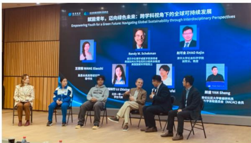
A glimpse into the roundtable session focusing on Empowering Youth for a Green Future: Navigating Global Sustainability through Interdisciplinary Perspectives

The forum also featured insightful keynote speeches focusing on “Building Trust and Connections Through Communication” and “Preparing for Success in University and Careers”, coupled with a roundtable on “Empowering Youth for a Green Future”. These sessions saw experts and students engage in fervent discussions about sustainable global development, exchanging unique perspectives and constructive insights.