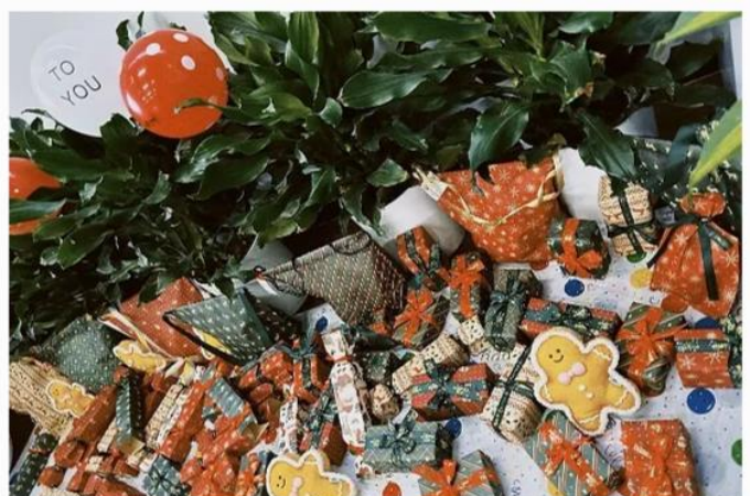
Season's Greetings from GEC: A Collection of Christmas Gifts

The offices were transformed into cozy, inviting spaces, with twinkling lights and charming Christmas decorations creating a festive yet intimate atmosphere. Amidst the laughter and friendly chatter, tables adorned with an array of delightful Christmas-themed treats added a sweet touch to the occasion.