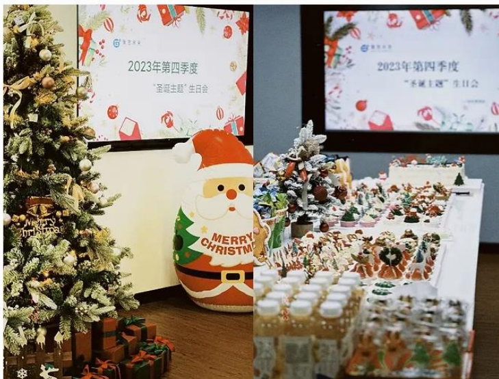
Christmas Decorations and Sweet Treats at Beijing Office Christmas Decorations and Sweet Treats at Beijing Office

On December 22nd, GEC Academy brought a touch of Christmas magic to its end-of-year birthday celebration. While the main event unfolded in the Beijing office, regional offices in Shanghai, Shenzhen, Guangzhou, Suzhou, Tianjin, and Chengdu also hosted their own charming celebrations, each adding a unique touch to the festive spirit. GECers gathered to share in a special celebration, marking not just another year gone by, but the warmth and camaraderie that defines the GEC family.