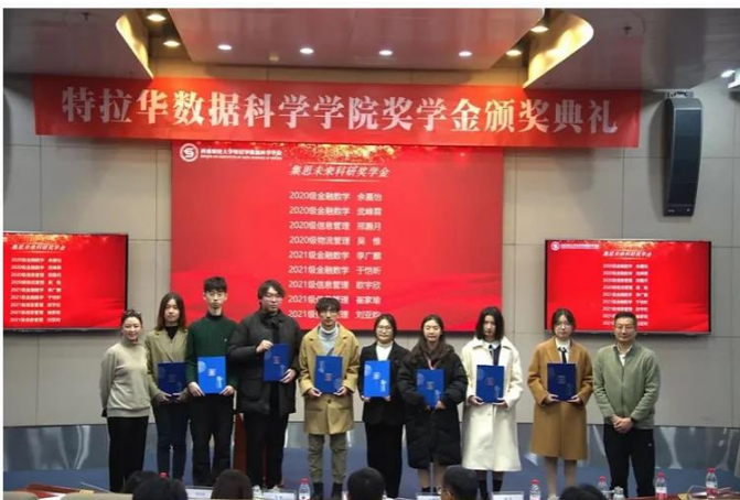
Delaware Data Science College GEC Research Scholarship Award Ceremony

A shining example of this fruitful collaboration is the GEC Research Scholarship at Delaware Data Science College, Southwest University of Finance and Economics. On December 22, the college hosted the scholarship award ceremony. This year, nine exceptional students specializing in fields such as Financial Mathematics, Information Management and Systems, and Logistics Management were honored with this scholarship.