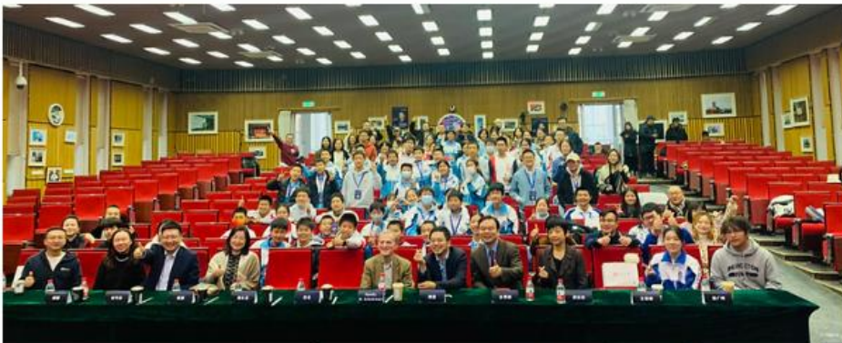
A group photo of participants at Beijing 101 High School

In the following day, GEC Academy officially kicked off the annual “World Top Scientists Forum” series at Beijing 101 High School, with the distinguished presence of Prof. Randy W. Schekman. With the theme of “How to Cultivate Innovative Talents: Exploring the Path of Youth Growth Guided by Practice”, the open lecture by Prof. Schekman marked a significant step of GEC in inspiring innovative thinking and nurturing the aspirations of Chinese youth to contribute to science and technology. This event also marked the inaugural major forum of GEC Academy for 2024, setting a high standard for the series of intellectual gatherings planned throughout the year.