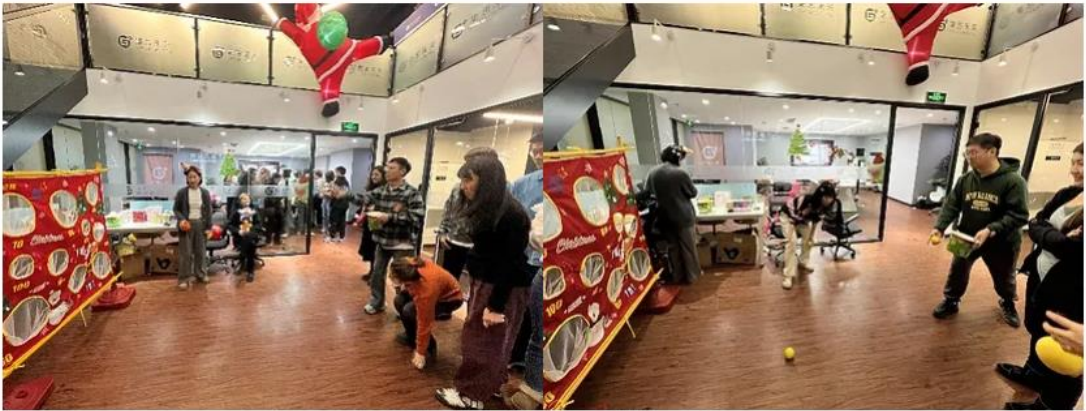
Fun at the Fair: Prize-Winning Ball Toss Game

This year's Christmas birthday bash at GEC Academy was more than just a celebration; it was a reflection of the collective spirit and joy that fills the halls of GEC. As employees shared stories and enjoyed the festive ambiance, there was a sense of gratitude for the year's successes and experiences.