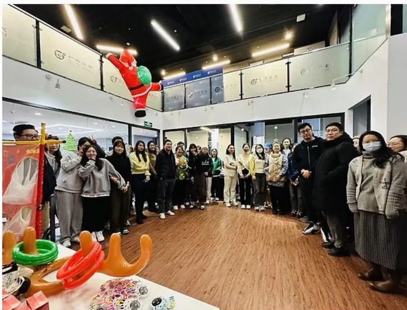
Group Photo from the Birthday Bash

Looking ahead to 2024, GEC Academy remains committed to nurturing this sense of community, ensuring that every team member feels valued and connected. Warm wishes, cheerful spirits, and a close-knit community – these are the gifts that GEC Academy cherishes as it steps into a new year full of potential and promise.