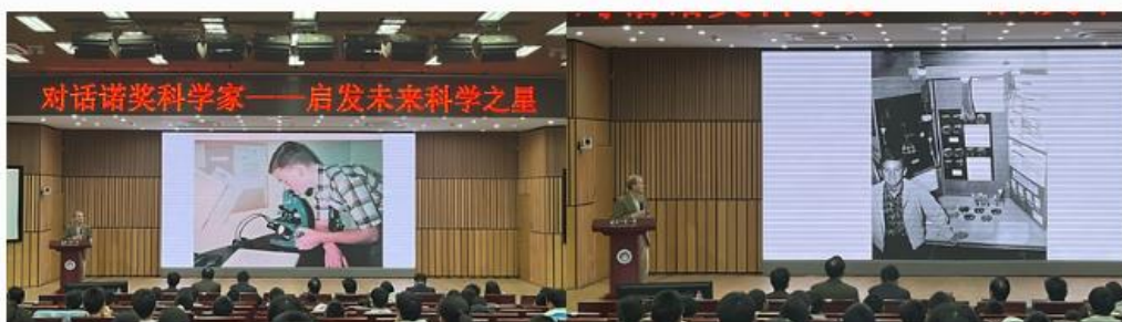
Prof. Schekman sharing his academic journey with the audience

Prof. Schekman captivated the audience with his open lecture, artfully intertwining his groundbreaking research in “science” and “cells”. He not only demystified complex scientific concepts but also shared personal stories of growth and discovery alongside fellow Nobel laureates. His interactive session prompted lively engagement from students, who eagerly questioned and learned from his experience.